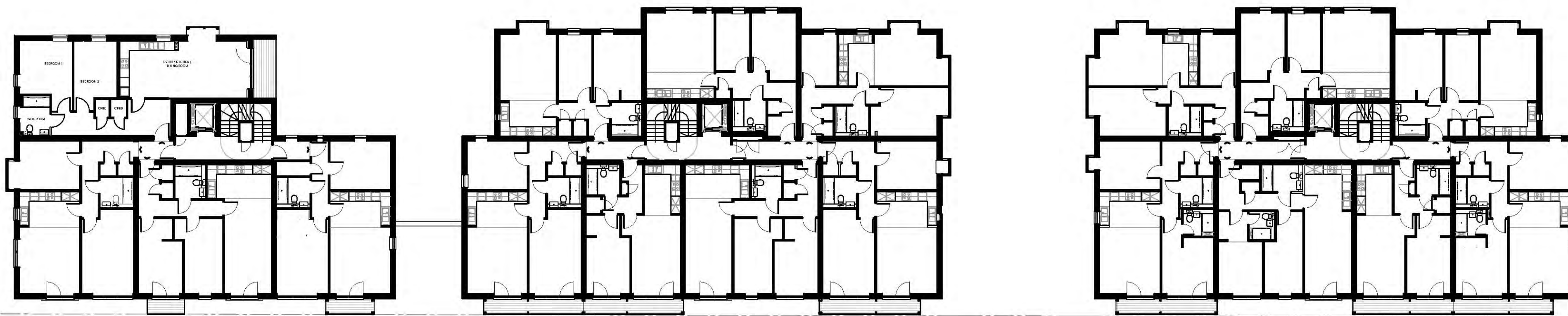
PROPOSED SECOND FLOOR PLAN SCALE 1:200 @A1